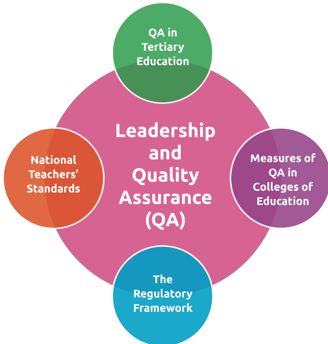
Components of the Leadership and Quality Assurance of Teaching and Learning Manual

The material is intended to provide the National Accreditation Board (NAB) and National Council for Tertiary Education (NCTE) with a framework for evaluating the quality of education and training provision in the Colleges of Education in Ghana. This manual is a reference document written to assist the various stakeholders understand the quality assurance framework for Colleges of Education. For the Colleges, this handbook therefore provides additional information on the quality assurance that leadership of colleges are to institutionalise as part of their journey to autonomy. Underpinning this manual are resources for College of Education Leaders as part of the T-TEL Leadership Programme component interventions. The Units are aimed at better leadership, management and governance of Colleges of Education through the combination of Professional Development and Quality Assurance approaches. This manual is divided into four chapters as illustrated below: