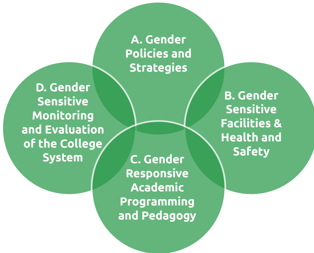
Gender and equality - Principal areas of focus